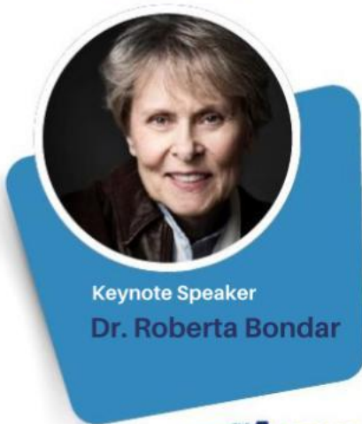
Keynote Speaker Dr. Roberta Bondar