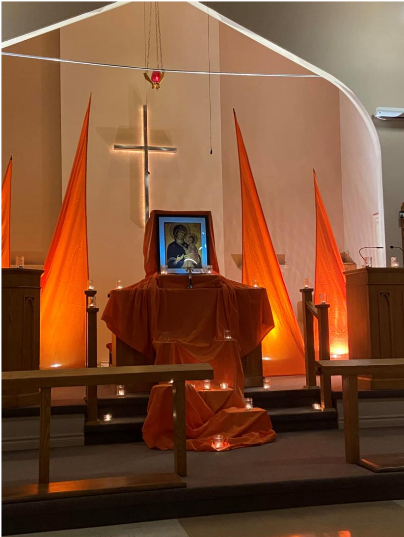
The Church of the Ascension, ready for the Taizé service a few weeks ago.