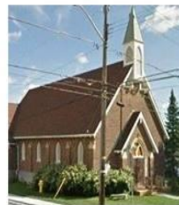
All People's United 1929 - 2019

The theme for the World Day of Prayer this year is "Come to the table...Everything is Ready" Luke 14:15-24